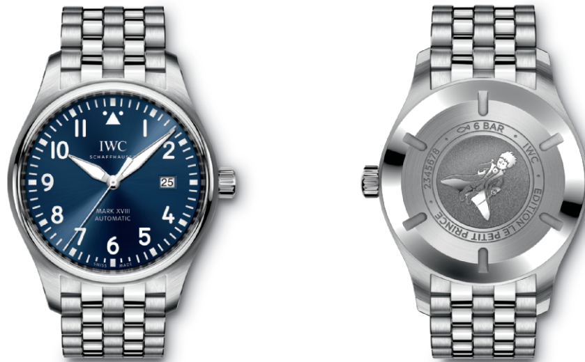
REF. IW 327016 in stainless steel with blue dial and stainless-steel bracelet

Mechanical movement · Self-winding · 42-hour power reserve when fully wound · Date display · Central hacking seconds · Soft-iron inner case for protection against magnetic fields · Screw-in crown · Sapphire glass, convex, antireflective coating on both sides · Glass secured against displacement by drops in air pressure · Engraving of “The Little Prince” on case back · Water-resistant 6 bar · Case height 10.8 mm · Diameter 40 mm