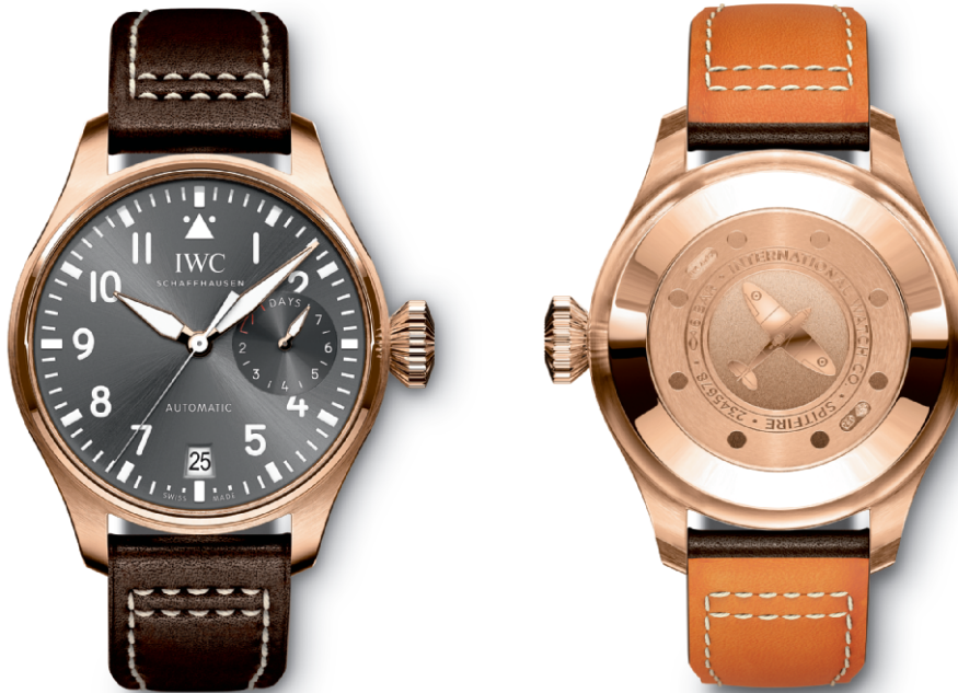
REF. IW500917 in 18-carat red gold with slate-coloured dial and brown calfskin strap

Mechanical movement · Pellaton automatic winding · IWC-manufactured 51111 calibre (50000-calibre family) · 7-day power reserve when fully wound · Power reserve display · Date display · Central hacking seconds · Breguet spring · Soft-iron inner case for protection against magnetic fields · Screw-in crown · Sapphire glass, convex, antireflective coating on both sides · Glass secured against displacement by drops in air pressure · Engraving of a Spitfire on case back · Water-resistant \infty 6 bar · Case height 15.8 mm · Diameter 46.2 mm · Calfskin strap by Santoni