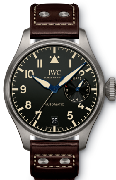
REF. IW501004 in titanium with black dial and brown calfskin strap

Limited edition of 1,500 watches in bronze · Mechanical movement · Pellaton automatic winding · IWC-manufactured 52110 calibre (52000-calibre family) · 7-day power reserve when fully wound · Power reserve display · Date display · Central hacking seconds · Breguet spring · Soft-iron inner case for protection against magnetic fields · Screw-in crown · Sapphire glass, convex, antireflective coating on both sides · Glass secured against displacement by drops in air pressure · Water-resistant \infty 6 bar · Case height 15.4 mm · Diameter 46.2 mm