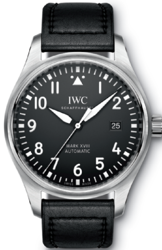
REF. IW327009 in stainless steel with black dial and black calfskin strap