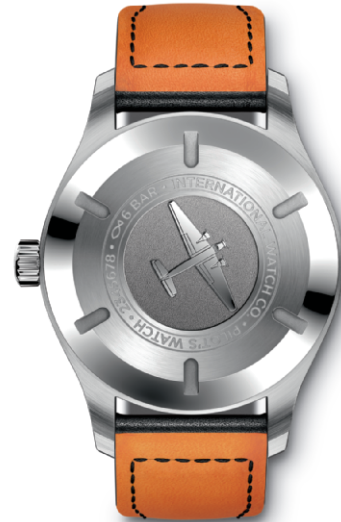
BACK VIEW for both References (illustrated is the IW327009)

Mechanical movement · Self-winding · 42-hour power reserve when fully wound · Date display · Central hacking seconds · Soft-iron inner case for protection against magnetic fields · Screw-in crown · Sapphire glass, convex, antireflective coating on both sides · Glass secured against displacement by drops in air pressure · Engraving of a JU-52 aircraft on case back · Water-resistant \infty 6 bar · Case height 10.8 mm · Diameter 40 mm · Calfskin strap by Santoni