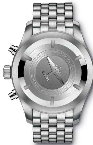
BACK VIEW for both References (illustrated is the IW377710)

Mechanical chronograph movement · Self-winding · 44-hour power reserve when fully wound · Date and day display · Stopwatch function with hours, minutes and seconds · Small hacking seconds · Soft-iron inner case for protection against magnetic fields · Screw-in crown · Sapphire glass, convex, antireflective coating on both sides · Glass secured against displacement by drops in air pressure · Engraving of a JU-52 aircraft on case back · Water-resistant \infty 6 bar · Case height 15.2 mm · Diameter 43 mm · Calfskin strap by Santoni