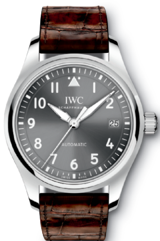
REF. IW324001 in stainless steel with slate-coloured dial and dark brown alligator leather strap