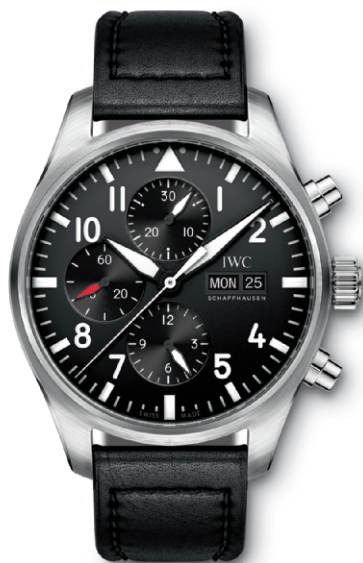
REF. IW377709 in stainless steel with black dial and black calfskin strap