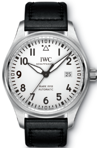
REF. IW327012 in stainless steel with silver-plated dial and black calfskin strap