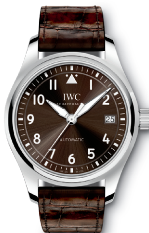
REF. IW324009 in stainless steel with brown dial and dark brown alligator leather strap

Mechanical movement · Self-winding · 42-hour power reserve when fully wound · Date display · Central hacking seconds · Soft-iron inner case for protection against magnetic fields · Screw-in crown · Sapphire glass, convex, antireflective coating on both sides · Glass secured against displacement by drops in air pressure · Water-resistant \infty 6 bar · Case height 10.4 mm · Diameter 36 mm · Alligator leather strap by Santoni