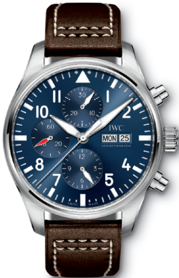
REF. IW377714 in stainless steel with blue dial and brown calfskin strap