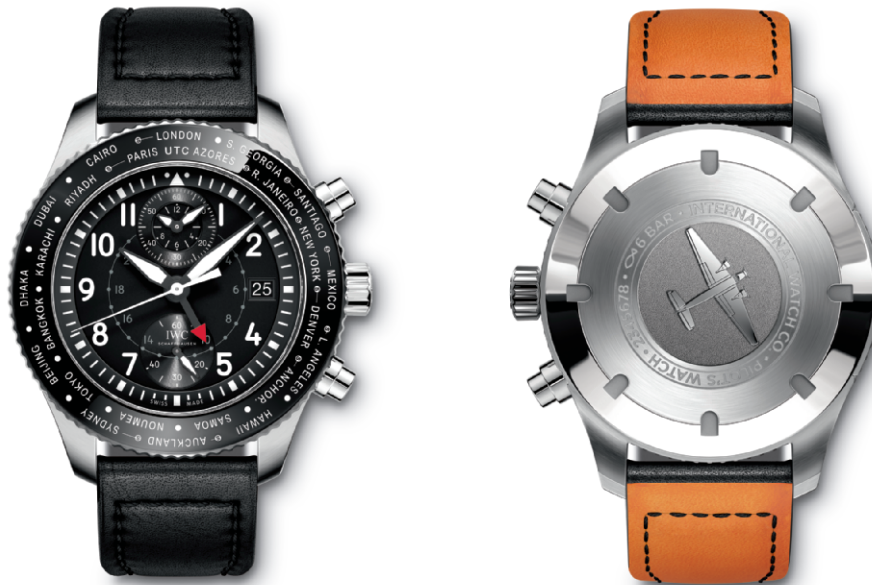
REF. IW 395001 in stainless steel with black dial and black calfskin strap

Mechanical chronograph movement · Self-winding · IWC-manufactured 89760 calibre (89000-calibre family) · 68-hour power reserve when fully wound · Date display · 24-hour display for Worldtimer function, adjustable via rotating bezel · Stopwatch function with hours, minutes and seconds · Hour and minute counters combined in a totalizer at 12 o'clock · Flyback function · Small hacking seconds · Screw-in crown · Sapphire glass, convex, antireflective coating on both sides · Glass secured against displacement by drops in air pressure · Engraving of a JU-52 aircraft on case back · Water-resistant \infty 6 bar · Case height 16.8 mm · Diameter 46 mm · Calfskin strap by Santoni