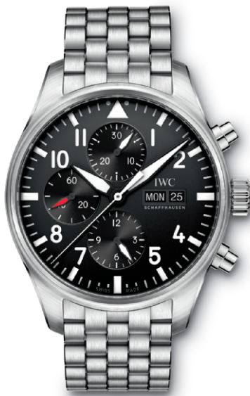
REF. IW377710 in stainless steel with black dial and stainless-steel bracelet