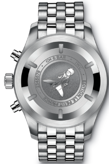
BACK VIEW for both References (illustrated is the IW377717)

Mechanical chronograph movement · Self-winding · 44-hour power reserve when fully wound · Date and day display · Stopwatch function with hours, minutes and seconds · Small hacking seconds · Soft-iron inner case for protection against magnetic fields · Screw-in crown · Sapphire glass, convex, antireflective coating on both sides · Glass secured against displacement by drops in air pressure · Engraving of “The Little Prince” on case back · Water-resistant ∞ 6 bar · Case height 15.2 mm · Diameter 43 mm · Calfskin strap by Santoni