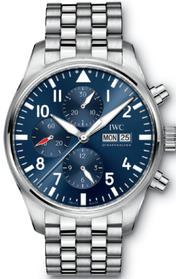
REF. IW377717 in stainless steel with blue dial and stainless-steel bracelet