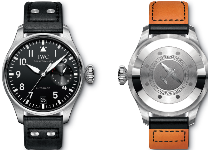
REF. IW501001 in stainless steel with black dial and black calfskin strap

Mechanical movement · Pellaton automatic winding · IWC-manufactured 52110 calibre (52000-calibre family) · 7-day power reserve when fully wound · Power reserve display · Date display · Central hacking seconds · Breguet spring · Soft-iron inner case for protection against magnetic fields · Screw-in crown · Sapphire glass, convex, antireflective coating on both sides · Glass secured against displacement by drops in air pressure · Engraving of a JU-52 aircraft on case back · Water-resistant \infty 6 bar · Case height 15.6 mm · Diameter 46.2 mm · Calfskin strap by Santoni