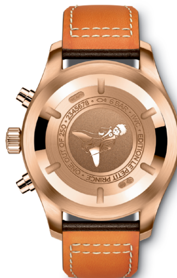
REF. IW 377721 in 18-carat red gold with blue dial and brown calfskin strap

Limited edition of 250 watches · Mechanical chronograph movement · Self-winding · 44-hour power reserve when fully wound · Date and day display · Stopwatch function with hours, minutes and seconds · Small hacking seconds · Soft-iron inner case for protection against magnetic fields · Screw-in crown · Sapphire glass, convex, antireflective coating on both sides · Glass secured against displacement by drops in air pressure · Engraving of “The Little Prince” on case back · Water-resistant \infty 6 bar · Case height 15.2 mm · Diameter 43 mm · Calfskin strap by Santoni