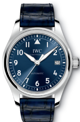
REF. IW 324008 in stainless steel with blue dial and dark blue alligator leather strap