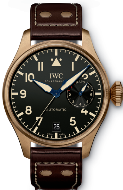
REF. IW501005 in bronze with black dial and brown calfskin strap