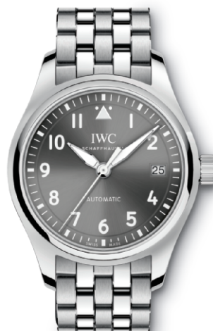
REF. IW 324002 in stainless steel with slate-coloured dial and stainless-steel bracelet

Mechanical movement · Self-winding · 42-hour power reserve when fully wound · Date display · Central hacking seconds · Soft-iron inner case for protection against magnetic fields · Screw-in crown · Sapphire glass, convex, antireflective coating on both sides · Glass secured against displacement by drops in air pressure · Water-resistant \infty 6 bar · Case height 10.4 mm · Diameter 36 mm · Alligator leather strap by Santoni