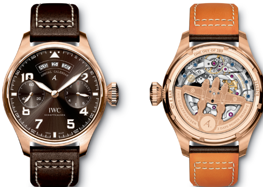
REF. IW502706 in 18-carat red gold with brown dial and brown calfskin strap

Limited edition of 250 watches · Mechanical movement · Pellaton automatic winding · IWC-manufactured 52850 calibre (52000-calibre family) · 7-day power reserve when fully wound · Power reserve display · Annual calendar with month, date and day · Small hacking seconds · Breguet spring · Rotor in 18-carat gold · Screw-in crown · Sapphire glass, convex, antireflective coating on both sides · Glass secured against displacement by drops in air pressure · See-through sapphire-glass back · Water-resistant \infty 6 bar · Case height 15.3 mm · Diameter 46.2 mm · Calfskin strap by Santoni