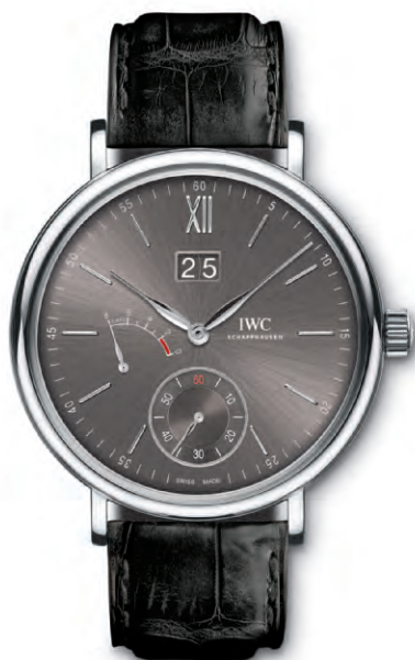
REF. IW516101 in 18-carat white gold with black alligator leather strap