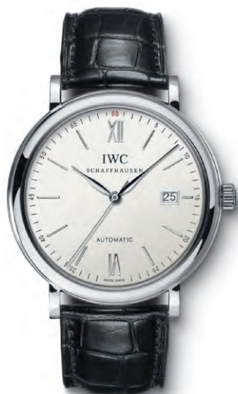
REF. IW356501 in stainless steel with black alligator leather strap