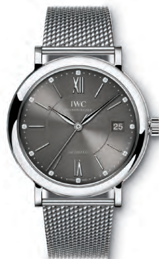
REF. IW458110 in stainless steel with 12 diamonds on the dial and Milanaise mesh bracelet in stainless steel

Mechanical movement · Self-winding · 42-hour power reserve when fully wound · Date display · Central hacking seconds · Sapphire glass, convex, antireflective coating on both sides · Water-resistant 3 bar · Case height 9 mm · Diameter 37 mm · Alligator leather strap by Santoni · Milanaise mesh bracelet in stainless steel