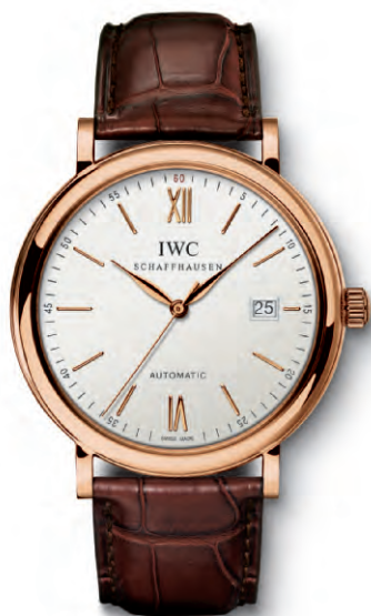
REF. IW356504 in 18-carat red gold with dark brown alligator leather strap