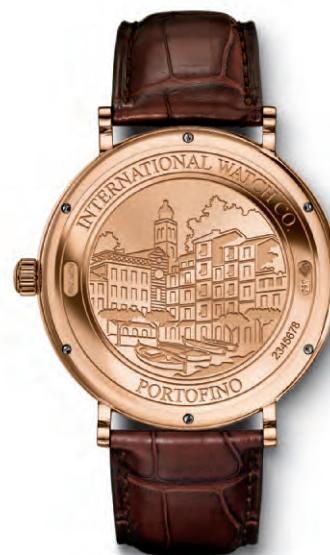
BACK VIEW for both References (shown here is IW356511)

Mechanical movement · Self-winding · 42-hour power reserve when fully wound · Date display · Central hacking seconds · Sapphire glass, convex, antireflective coating on both sides · Special back engraving · Water-resistant 3 bar · Case height 9.5 mm · Diameter 40 mm