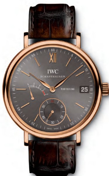
REF. IW510104 in 18-carat red gold with dark brown alligator leather strap