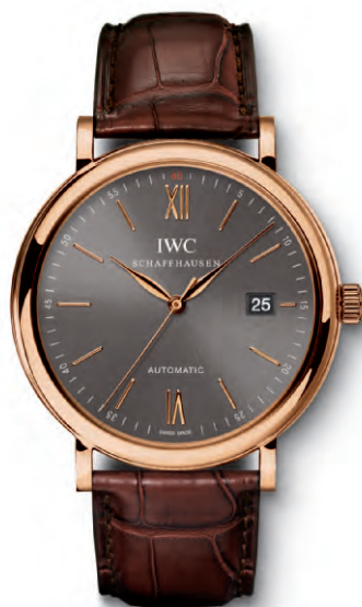
REF. IW356511 in 18-carat red gold with dark brown alligator leather strap