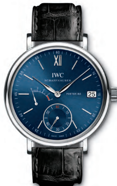
REF. IW510106 in stainless steel with black alligator leather strap

Mechanical movement · Hand-wound · IWC-manufactured 59210 calibre (59000-calibre family) · 8-day power reserve when fully wound · Power reserve display · Date display · Small hacking seconds · Breguet spring · Sapphire glass, arched edge, antireflective coating on both sides · See-through sapphire-glass back · Water-resistant 3 bar · Case height 12 mm · Diameter 45 mm · Alligator leather strap by Santoni