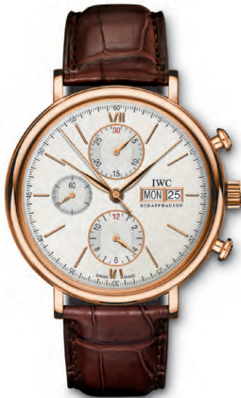
REF. IW391020 in 18-carat red gold with dark brown alligator leather strap