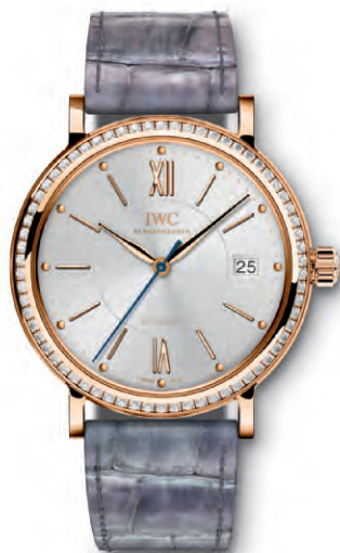
REF. IW458107 in 18-carat red gold with 66 diamonds on the case and lilac alligator leather strap