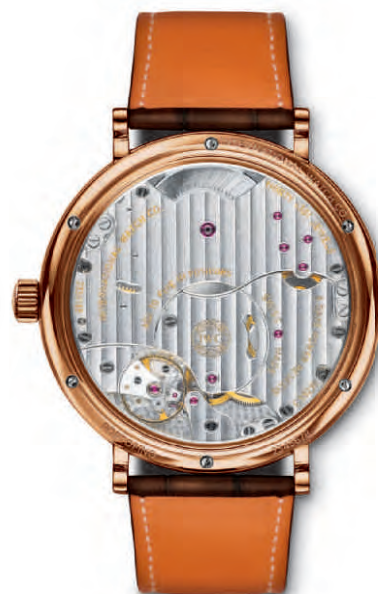
BACK VIEW for both References (shown here is IW516102)

Mechanical movement · Hand-wound · IWC-manufactured 59230 calibre (59000-calibre family) · 8-day power reserve when fully wound · Power reserve display · Large, double-digit date display · Small hacking seconds · Breguet spring · Sapphire glass, arched edge, antireflective coating on both sides · See-through sapphire-glass back · Water-resistant 3 bar · Case height 13 mm · Diameter 45 mm · Alligator leather strap by Santoni