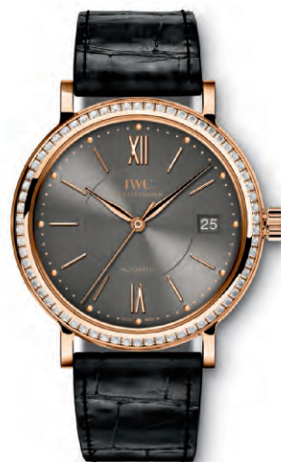
REF. IW458108 in 18-carat red gold with 66 diamonds on the case and black alligator leather strap

Mechanical movement · Self-winding · 42-hour power reserve when fully wound · Date display · Central hacking seconds · Sapphire glass, convex, antireflective coating on both sides · Water-resistant 3 bar · Case height 9 mm · Diameter 37 mm · Alligator leather strap by Santoni