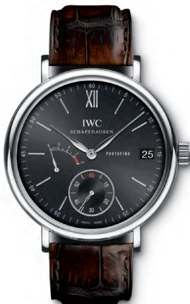
REF. IW510102 in stainless steel with dark brown alligator leather strap