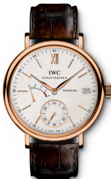
REF. IW510107 in 18-carat red gold with dark brown alligator leather strap

Mechanical movement · Hand-wound · IWC-manufactured 59210 calibre (59000-calibre family) · 8-day power reserve when fully wound · Power reserve display · Date display · Small hacking seconds · Breguet spring · Sapphire glass, arched edge, antireflective coating on both sides · See-through sapphire-glass back · Water-resistant 3 bar · Case height 12 mm · Diameter 45 mm · Alligator leather strap by Santoni