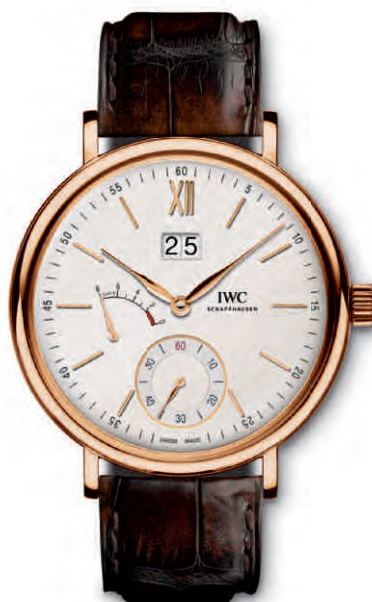
REF. IW516102 in 18-carat red gold with dark brown alligator leather strap