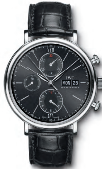
REF. IW391008 in stainless steel with black alligator leather strap

Mechanical chronograph movement · Self-winding · 44-hour power reserve when fully wound · Date and day display · Stopwatch function with hours, minutes and seconds · Small hacking seconds · Sapphire glass, convex, antireflective coating on both sides · Water-resistant 3 bar · Case height 13.5 mm · Diameter 42 mm