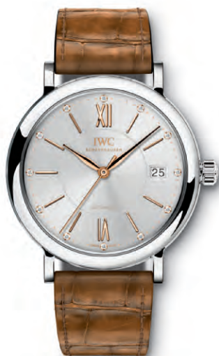
REF. IW458101 in stainless steel with 12 diamonds on the dial and light brown alligator leather strap