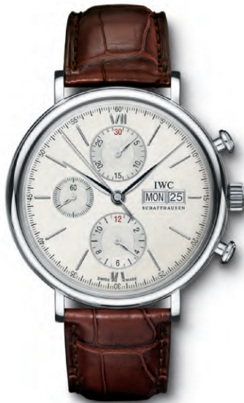
REF. IW391007 in stainless steel with dark brown alligator leather strap