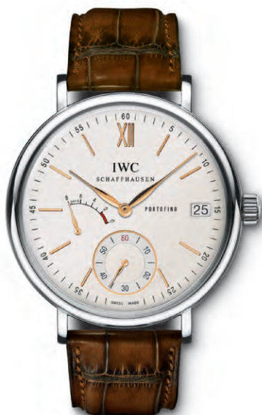
REF. IW510103 in stainless steel with brown alligator leather strap