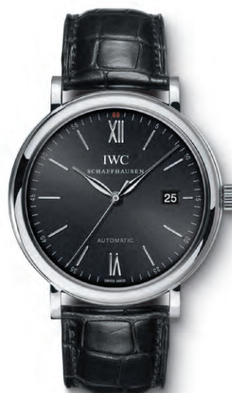
REF. IW356502 in stainless steel with black alligator leather strap

Mechanical movement · Self-winding · 42-hour power reserve when fully wound · Date display · Central hacking seconds · Sapphire glass, convex, antireflective coating on both sides · Water-resistant 3 bar · Case height 9.5 mm · Diameter 40 mm