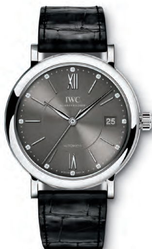
REF. IW458102 in stainless steel with 12 diamonds on the dial and black alligator leather strap