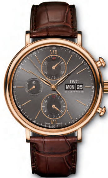
REF. IW391021 in 18-carat red gold with dark brown alligator leather strap

Mechanical chronograph movement · Self-winding · 44-hour power reserve when fully wound · Date and day display · Stopwatch function with hours, minutes and seconds · Small hacking seconds · Sapphire glass, convex, antireflective coating on both sides · Special back engraving · Water-resistant 3 bar · Case height 13.5 mm · Diameter 42 mm