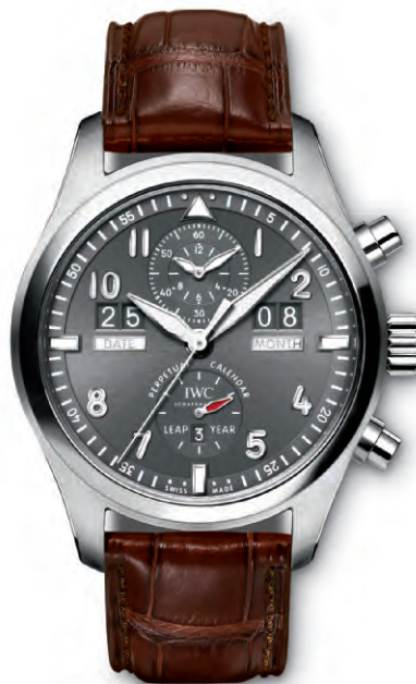
REF. IW379107 in stainless steel with brown alligator leather strap

Mechanical chronograph movement · Self-winding · IWC-manufactured 89801 calibre (89000-calibre family) · 68-hour power reserve when fully wound · Perpetual calendar · Large double-digit displays for both the date and month · Leap year display · Stopwatch function with hours, minutes and seconds · Hour and minute counters combined in a totalizer at 12 o'clock · Flyback function · Small hacking seconds · Screw-in crown · Sapphire glass, convex, antireflective coating on both sides · Glass secured against displacement by drops in air pressure · See-through sapphire-glass back · Water-resistant 6 bar · Case height 17.5 mm · Diameter 46 mm