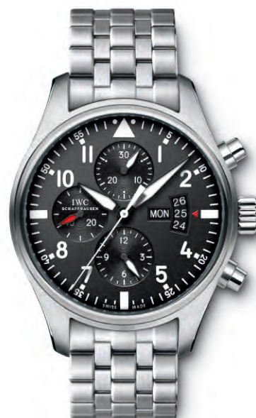
REF. IW377704 in stainless steel with stainless-steel bracelet

Mechanical chronograph movement · Self-winding · 44-hour power reserve when fully wound · Date and day display · Stopwatch function with hours, minutes and seconds · Small hacking seconds · Soft-iron inner case for protection against magnetic fields · Screw-in crown · Sapphire glass, convex, antireflective coating on both sides · Glass secured against displacement by drops in air pressure · Water-resistant 6 bar · Case height 15 mm · Diameter 43 mm