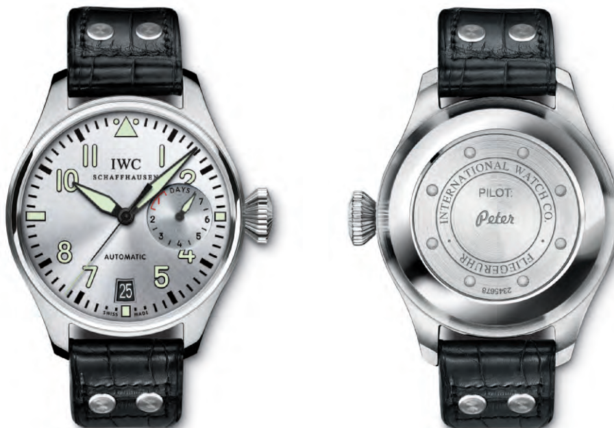
REF. IW500906 in stainless steel with black alligator leather strap

Mechanical movement · Pellaton automatic winding · IWC-manufactured 51111 calibre (50000-calibre family) · 7-day power reserve when fully wound · Power reserve display · Date display · Central hacking seconds · Glucydur® beryllium alloy balance with high-precision adjustment cam on balance arms · Breguet spring · Screw-in crown · Sapphire glass, convex, antireflective coating on both sides · Glass secured against displacement by drops in air pressure · Water-resistant 6 bar · Case height 16 mm · Diameter 46 mm