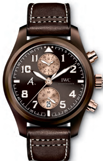
REF. IW388006 in silicon nitride and 18-carat red gold with brown calfskin strap