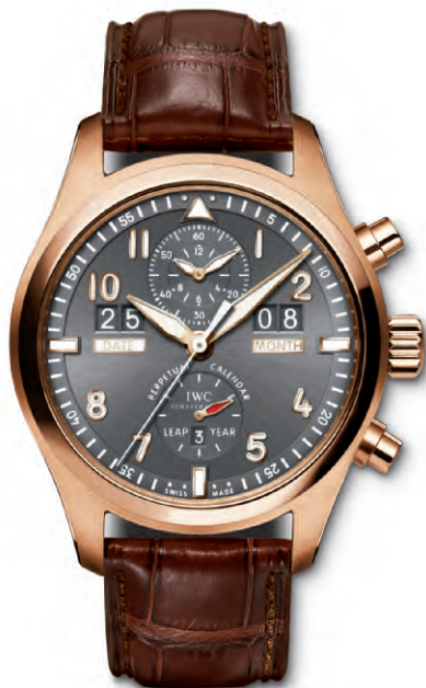
REF. IW379105 in 18-carat red gold with brown alligator leather strap