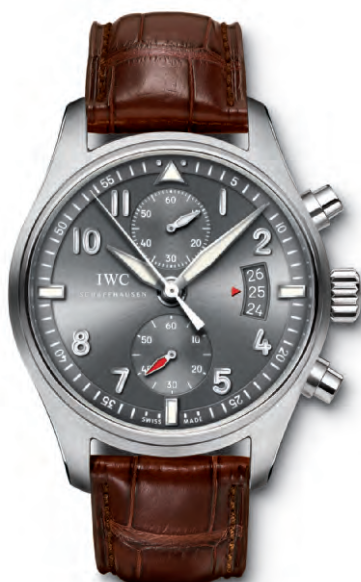
REF. IW387802 in stainless steel with brown alligator leather strap