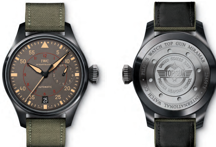
REF. IW501902 in ceramic with green textile strap

Mechanical movement · Pellaton automatic winding · IWC-manufactured 51111 calibre (50000-calibre family) · 7-day power reserve when fully wound · Power reserve display · Date display · Central hacking seconds · Glucydur®* beryllium alloy balance with high-precision adjustment cam on balance arms · Breguet spring · Screw-in crown · Sapphire glass, convex, antireflective coating on both sides · Glass secured against displacement by drops in air pressure · Water-resistant 6 bar · Case height 15 mm · Diameter 48 mm