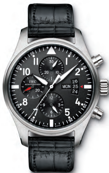
REF. IW377701 in stainless steel with black alligator leather strap