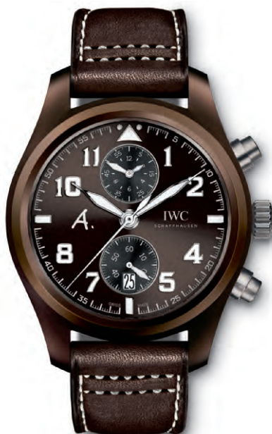
REF. IW388004 in silicon nitride and titanium with brown calfskin strap