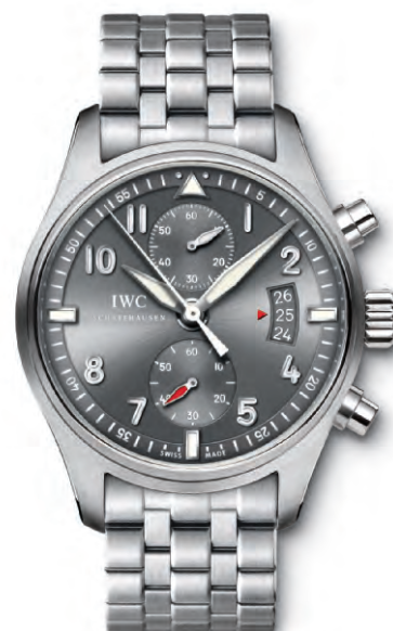
REF. IW387804 in stainless steel with stainless-steel bracelet

Mechanical chronograph movement · Self-winding · IWC-manufactured 89365 calibre (89000-calibre family) · 68-hour power reserve when fully wound · Date display · Stopwatch function with minutes and seconds · Flyback function · Small hacking seconds · Screw-in crown · Sapphire glass, convex, antireflective coating on both sides · Glass secured against displacement by drops in air pressure · Special back engraving · Water-resistant 6 bar · Case height 15.5 mm · Diameter 43 mm