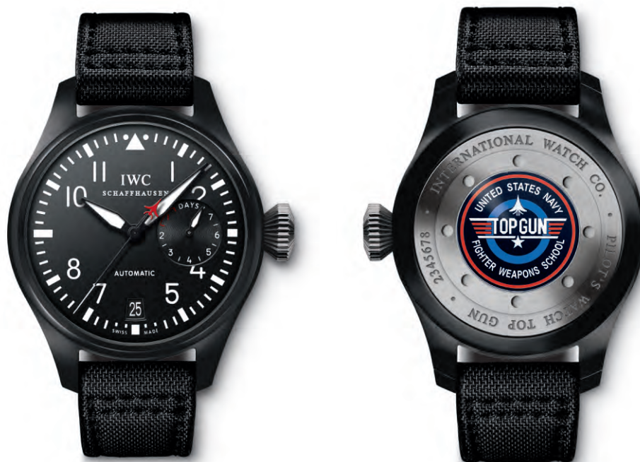
REF. IW501901 in ceramic with black soft strap

Mechanical movement · Pellaton automatic winding · IWC-manufactured 51111 calibre (50000-calibre family) · 7-day power reserve when fully wound · Power reserve display · Date display · Central hacking seconds · Glucydur® beryllium alloy balance with high-precision adjustment cam on balance arms · Breguet spring · Screw-in crown · Sapphire glass, convex, antireflective coating on both sides · Glass secured against displacement by drops in air pressure · Water-resistant 6 bar · Case height 15 mm · Diameter 48 mm