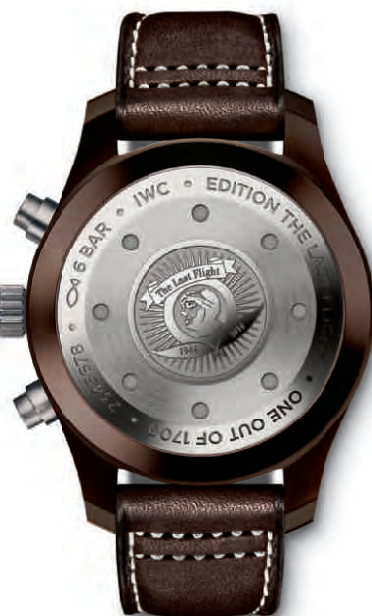
BACK VIEW for both References (shown here is IW388004)

Limited edition of 170 watches in 18-carat red gold and 1,700 watches in titanium · Mechanical chronograph movement · Self-winding · IWC-manufactured 89361 calibre (89000-calibre family) · 68-hour power reserve when fully wound · Date display · Stopwatch function with hours, minutes and seconds · Hour and minute counters combined in a totalizer at 12 o'clock · Flyback function · Small hacking seconds · Screw-in crown · Sapphire glass, convex, antireflective coating on both sides · Glass secured against displacement by drops in air pressure · Special back engraving · Water-resistant 6 bar · Case height 16.5 mm · Diameter 46 mm