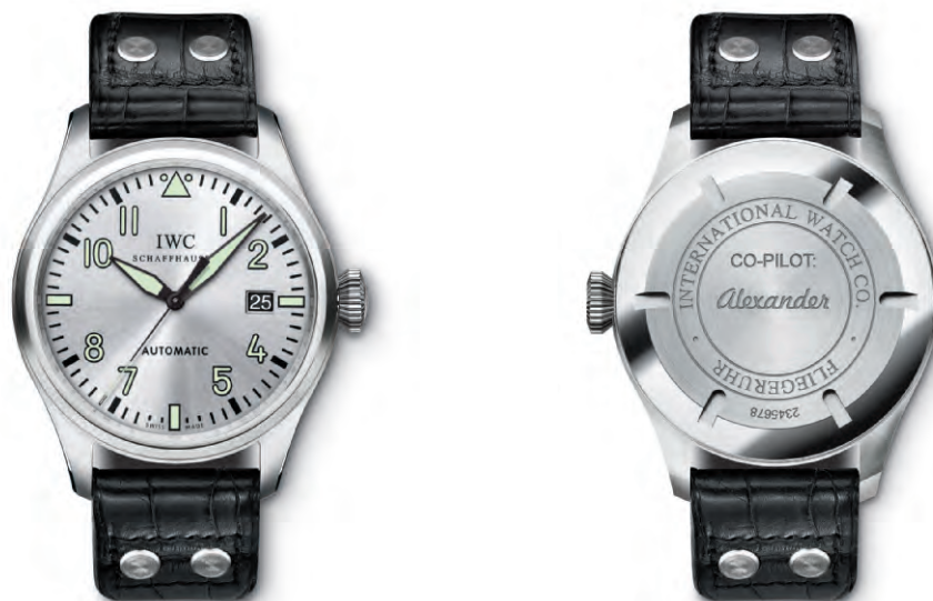
REF. IW325519 in stainless steel with black alligator leather strap

Mechanical movement · Self-winding · 42-hour power reserve when fully wound · Date display · Central hacking seconds · Screw-in crown · Sapphire glass, convex, antireflective coating on both sides · Glass secured against displacement by drops in air pressure · Water-resistant 6 bar · Case height 11 mm · Diameter 39 mm