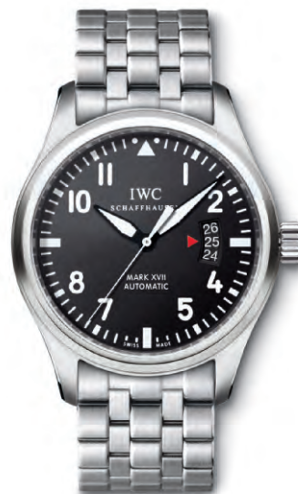
REF. IW326504 in stainless steel with stainless-steel bracelet

Mechanical movement · Self-winding · 42-hour power reserve when fully wound · Date display · Central hacking seconds · Soft-iron inner case for protection against magnetic fields · Screw-in crown · Sapphire glass, convex, antireflective coating on both sides · Glass secured against displacement by drops in air pressure · Water-resistant 6 bar · Case height 11 mm · Diameter 41 mm