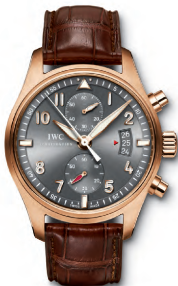
REF. IW387803 in 18-carat red gold with brown alligator leather strap