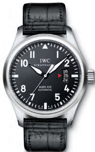
REF. IW326501 in stainless steel with black alligator leather strap