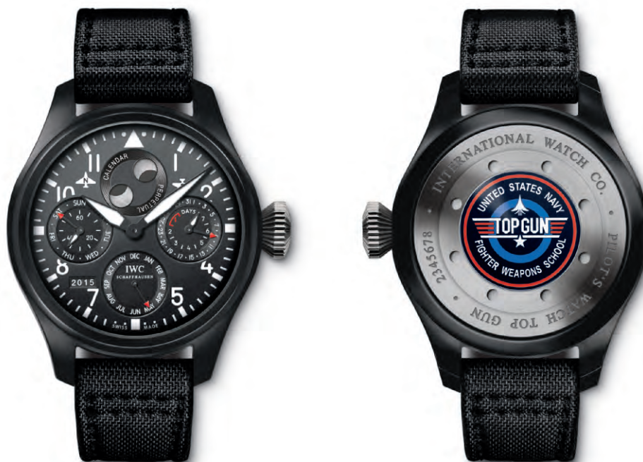
REF. IW502902 in ceramic with black soft strap

Mechanical movement · Pellaton automatic winding · IWC-manufactured 51614 calibre (50000-calibre family) · 7-day power reserve when fully wound · Power reserve display · Perpetual calendar with displays for the date, day and month · Perpetual moon phase display · Double moon phases for the northern and southern hemispheres · Small hacking seconds · Glucydur® beryllium alloy balance with high-precision adjustment cam on balance arms · Breguet spring · Screw-in crown · Sapphire glass, convex, antireflective coating on both sides · Glass secured against displacement by drops in air pressure · Water-resistant 6 bar · Case height 16 mm · Diameter 48 mm