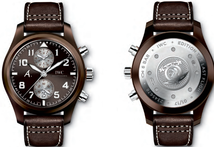
REF. IW388005 in silicon nitride and platinum with brown calfskin strap

Limited edition of 17 watches in platinum · Mechanical chronograph movement · Self-winding · IWC-manufactured 89361 calibre (89000-calibre family) · 68-hour power reserve when fully wound · Date display · Stopwatch function with hours, minutes and seconds · Hour and minute counters combined in a totalizer at 12 o'clock · Flyback function · Small hacking seconds · Screw-in crown · Sapphire glass, convex, antireflective coating on both sides · Glass secured against displacement by drops in air pressure · Special back engraving · Water-resistant 6 bar · Case height 16.5 mm · Diameter 46 mm