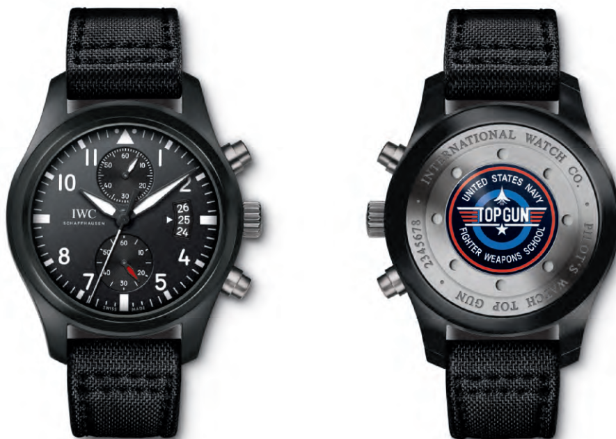
REF. IW388007 in ceramic with black soft strap

Mechanical chronograph movement · Self-winding · IWC-manufactured 89365 calibre (89000-calibre family) · 68-hour power reserve when fully wound · Date display · Stopwatch function with minutes and seconds · Flyback function · Small hacking seconds · Soft-iron inner case for protection against magnetic fields · Screw-in crown · Sapphire glass, convex, antireflective coating on both sides · Glass secured against displacement by drops in air pressure · Water-resistant 6 bar · Case height 16.5 mm · Diameter 46 mm