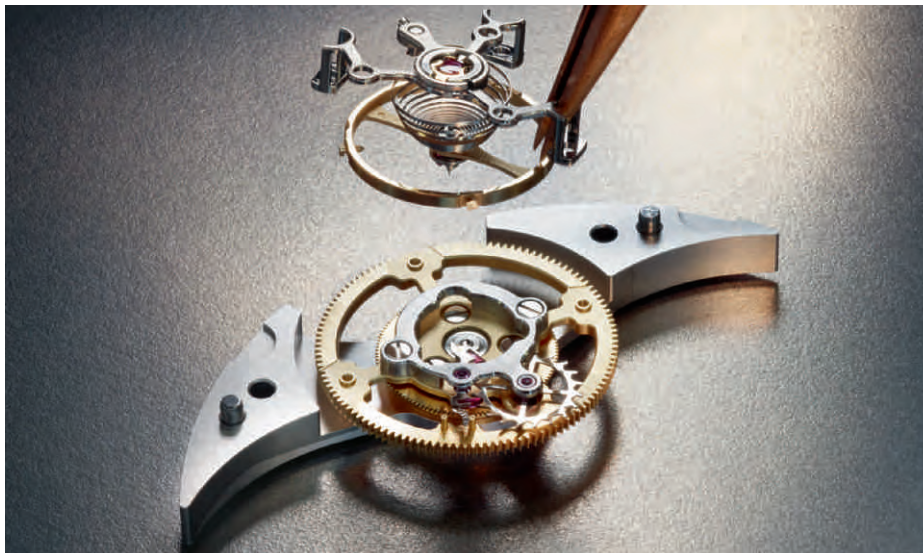
A major challenge during assembly – the tourbillon in the Portuguese Tourbillon Hand-Wound consists of 64 individual parts

————— In the Portuguese Tourbillon Hand-Wound, the “whirlwind” – as the word tourbillon translates – revolves on its axis at “9 o’clock” on the dial; or, in nautical terms, at 270 degrees west. The sight of the mechanical, cantilever-mounted minute tourbillon invariably attracts rapt attention from watch lovers. The tourbillon rotates around its own axis once every 60 seconds to counteract the pull of gravity on any disequilibrium in the balance wheel that would adversely affect the watch’s rate and accuracy. The arched-edge front glass gives the watch a more classical and balanced appearance and optically reduces its height. The dial was chosen to match