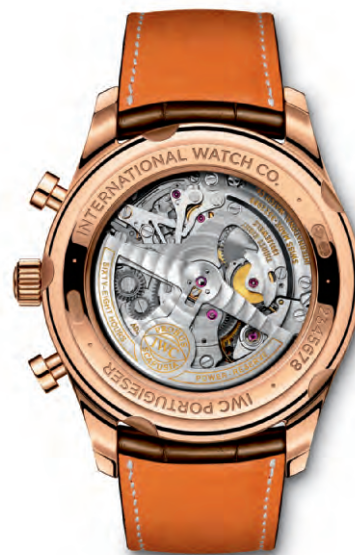
BACK VIEW for both References (shown here is IW390402)

Mechanical chronograph movement · Self-winding · IWC-manufactured 89361 calibre (89000-calibre family) · 68-hour power reserve when fully wound · Date display · Stopwatch function with hours, minutes and seconds · Hour and minute counters combined in a totalizer at 12 o'clock · Flyback function · Small hacking seconds · Sapphire glass, arched edge, antireflective coating on both sides · See-through sapphire-glass back · Water-resistant 3 bar · Case height 14.5 mm · Diameter 42 mm · Alligator leather strap by Santoni