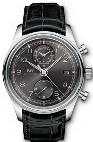
REF. IW390404 in stainless steel with black alligator leather strap