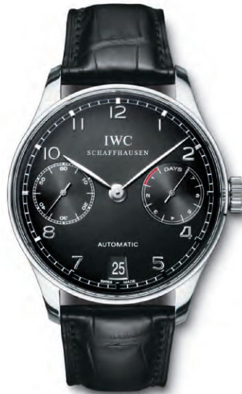
REF. IW500109 in stainless steel with black alligator leather strap

Mechanical movement · Pellaton automatic winding · IWC-manufactured 51011 calibre (50000-calibre family) · 7-day power reserve when fully wound · Power reserve display · Date display · Small hacking seconds at 9 o'clock · Glucydur®* beryllium alloy balance with high-precision adjustment cam on balance arms · Breguet spring · Rotor with 18-carat gold medallion · Sapphire glass, convex, antireflective coating on both sides · See-through sapphire-glass back · Water-resistant 3 bar · Case height 14 mm · Diameter 42.3 mm