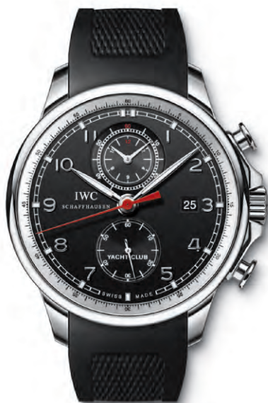
REF. IW390210 in stainless steel with black rubber strap