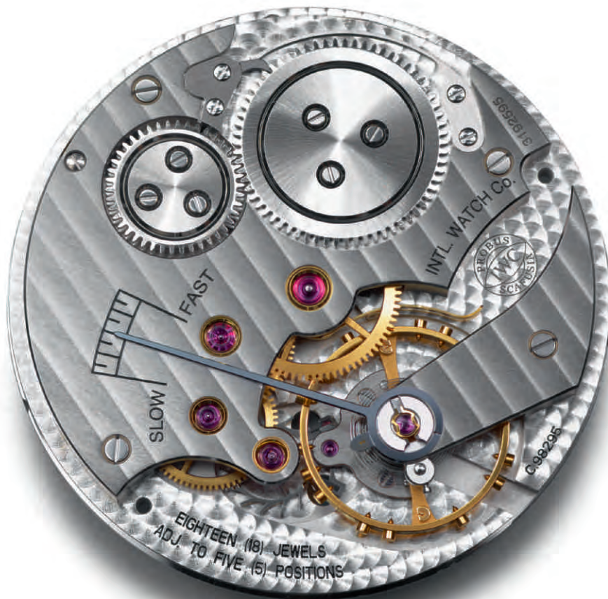
The IWC-manufactured 98295 calibre, the basic movement of the Portuguese Minute Repeater, has an elongated index for precision adjustment of the balance spring's effective length