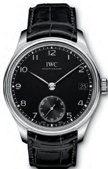
REF. IW510202 in stainless steel with black alligator leather strap