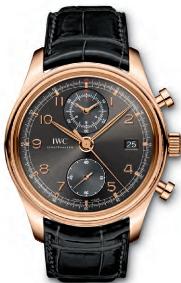
REF. IW390405 in 18-carat red gold with black alligator leather strap