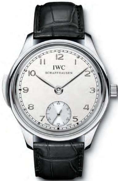
REF. IW544906 in platinum with black alligator leather strap