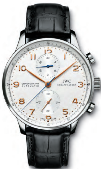
REF. IW371445 in stainless steel with black alligator leather strap