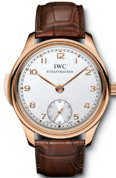
REF. IW544907 in 18-carat red gold with brown alligator leather strap

Limited edition of 500 watches each in platinum and 18-carat red gold · Mechanical movement · Hand-wound · IWC-manufactured 98950 calibre (98000-calibre family) · 46-hour power reserve when fully wound · Minute repeater for hours, quarters and minutes · Small hacking seconds · Glucydur®* beryllium alloy balance with high-precision adjustment cam on balance arms · Breguet spring · Three-quarter bridge · Sapphire glass, arched edge, antireflective coating on both sides · See-through sapphire-glass back · Case height 14 mm · Diameter 44 mm