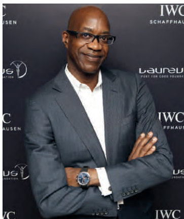
Edwin Moses, Chairman of the Laureus World Sports Academy

Since its inception, Laureus has supported projects which have helped to improve the lives of over 1.5 million young people. The Foundation is actively supported in its work by the Laureus World Sports Academy, whose members – all much-respected sporting figures – come from every part of the globe. Between them they hold over 100 Olympic medals, 100 world championship titles and 200 world records. Academy Members like Mark Spitz, Sergey Bubka and Cathy Freeman work jointly with the Chairman of the Laureus World Sports Academy, Edwin Moses, using sport as a means of helping young children in their mental, physical and social development. National Foundations in Argentina, Germany, Italy, the Netherlands, Spain, South Africa, Switzerland and the USA provide the projects with on-the-spot support.