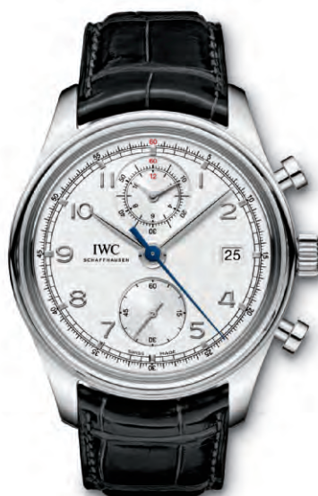
REF. IW390403 in stainless steel with black alligator leather strap

Mechanical chronograph movement · Self-winding · IWC-manufactured 89361 calibre (89000-calibre family) · 68-hour power reserve when fully wound · Date display · Stopwatch function with hours, minutes and seconds · Hour and minute counters combined in a totalizer at 12 o'clock · Flyback function · Small hacking seconds · Sapphire glass, arched edge, antireflective coating on both sides · See-through sapphire-glass back · Water-resistant 3 bar · Case height 14.5 mm · Diameter 42 mm · Alligator leather strap by Santoni