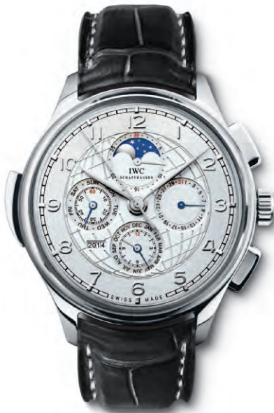
REF. IW377401 in platinum with black alligator leather strap