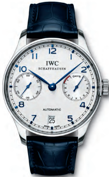
REF. IW500107 in stainless steel with blue alligator leather strap