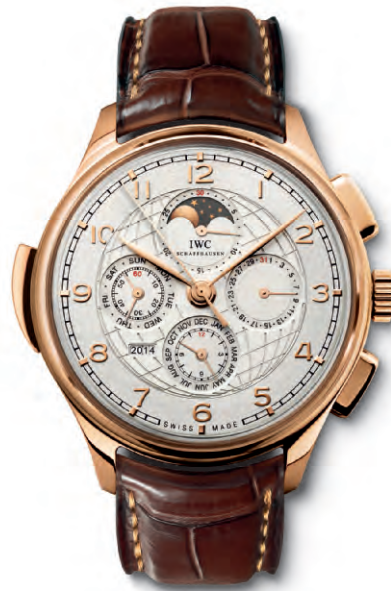
REF. IW377402 in 18-carat red gold with dark brown alligator leather strap

Limited edition of a total of 100 watches per year · Mechanical chronograph movement · Self-winding · 44-hour power reserve when fully wound · Perpetual calendar with displays for the date, day, month, year in four digits and perpetual moon phase · Stopwatch function with hours, minutes and seconds · Minute repeater for hours, quarters and minutes · Small hacking seconds · Sapphire glass, arched edge, antireflective coating on both sides · Special back engraving · Water-resistant 3 bar · Case height 16.5 mm · Diameter 45 mm