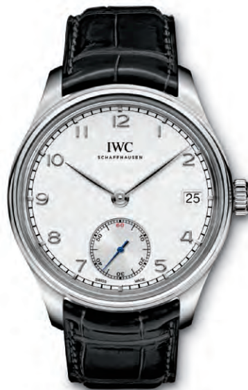
REF. IW510203 in stainless steel with black alligator leather strap

Mechanical movement · Hand-wound · IWC-manufactured 59215 calibre (59000-calibre family) · 8-day power reserve when fully wound · Power reserve display on reverse side · Date display · Small hacking seconds · Breguet spring · Sapphire glass, arched edge, antireflective coating on both sides · See-through sapphire-glass back · Water-resistant 3 bar · Case height 12 mm · Diameter 43 mm · Alligator leather strap by Santoni