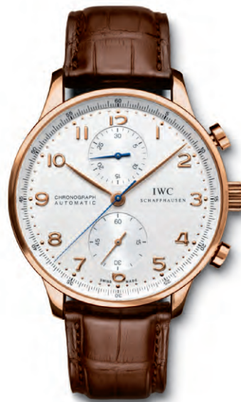
REF. IW371480 in 18-carat red gold with dark brown alligator leather strap

Mechanical chronograph movement · Self-winding · 44-hour power reserve when fully wound · Stopwatch function with minutes and seconds · Small hacking seconds · Sapphire glass, convex, antireflective coating on both sides · Water-resistant 3 bar · Case height 12.3 mm · Diameter 40.9 mm