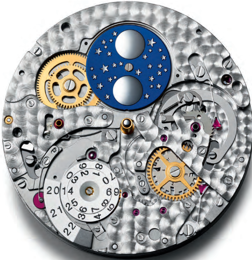
The IWC-manufactured 51613 movement from the dial side. Clearly visible are the moon phase display and the discs for the year in four digits