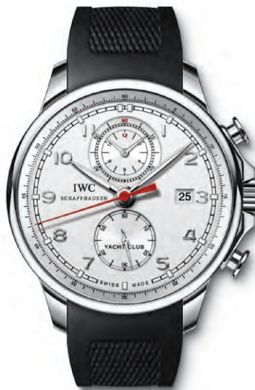
REF. IW390211 in stainless steel with black rubber strap

Mechanical chronograph movement · Self-winding · IWC-manufactured 89361 calibre (89000-calibre family) · 68-hour power reserve when fully wound · Date display · Stopwatch function with hours, minutes and seconds · Hour and minute counters combined in a totalizer at 12 o'clock · Flyback function · Small hacking seconds · Screw-in crown · Sapphire glass, convex, antireflective coating on both sides · See-through sapphire-glass back · Water-resistant 6 bar · Case height 14.5 mm · Diameter 45.4 mm