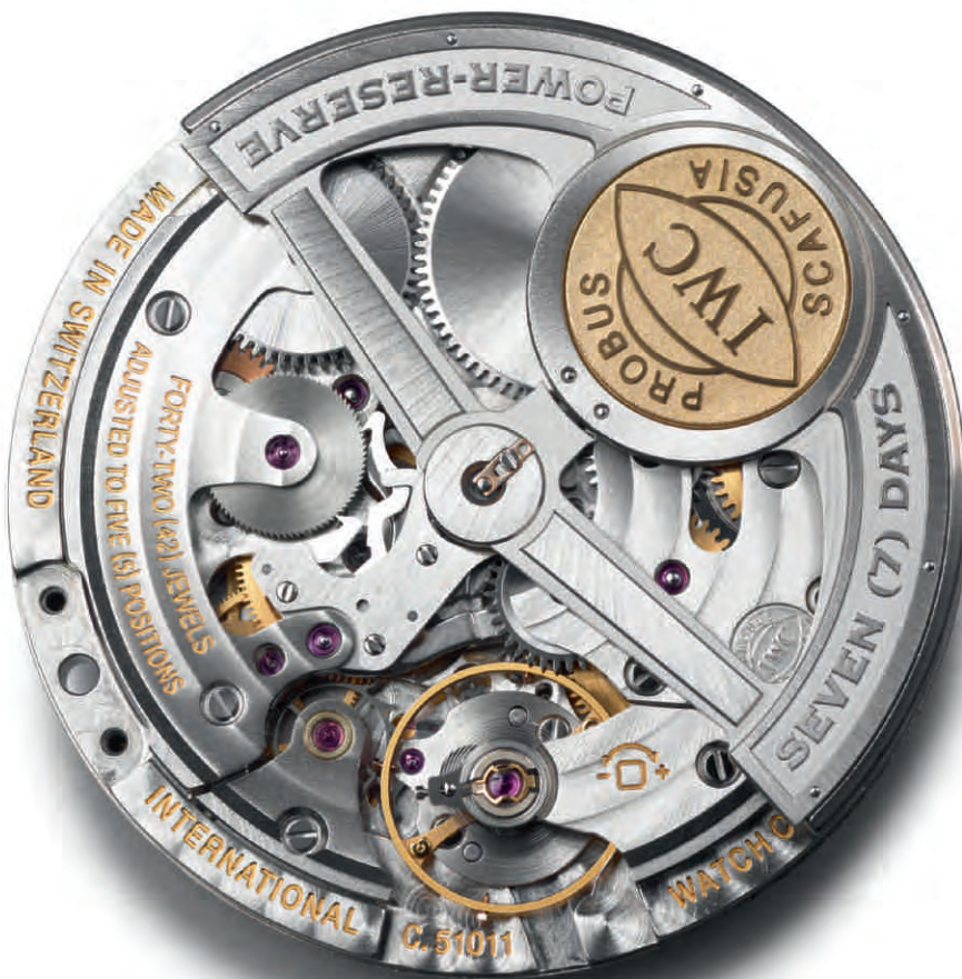
The voluminous IWC-manufactured 51011 calibre with its spring-mounted rotor and Pellaton pawl-winding system