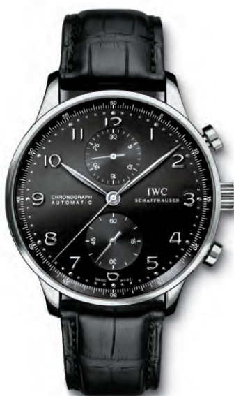
REF. IW371447 in stainless steel with black alligator leather strap