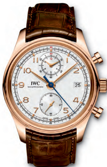
REF. IW390402 in 18-carat red gold with brown alligator leather strap