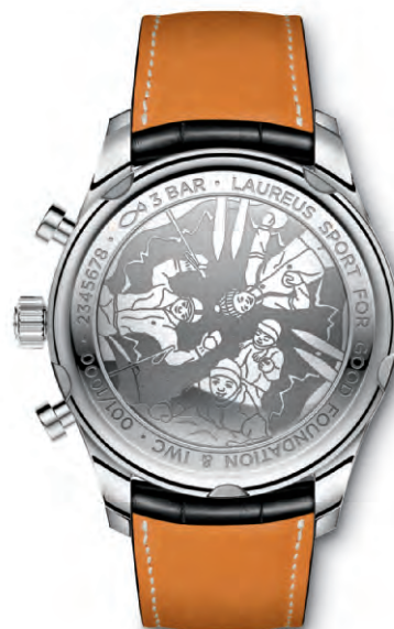
REF. IW390406 in stainless steel with black alligator leather strap

Limited edition of 1,000 watches in stainless steel · Mechanical chronograph movement · Self-winding · IWC-manufactured 89361 calibre (89000-calibre family) · 68-hour power reserve when fully wound · Date display · Stopwatch function with hours, minutes and seconds · Hour and minute counters combined in a totalizer at 12 o'clock · Flyback function · Small hacking seconds · Sapphire glass, arched edge, antireflective coating on both sides · Special back engraving · Water-resistant 3 bar · Case height 14.5 mm · Diameter 42 mm · Alligator leather strap by Santoni