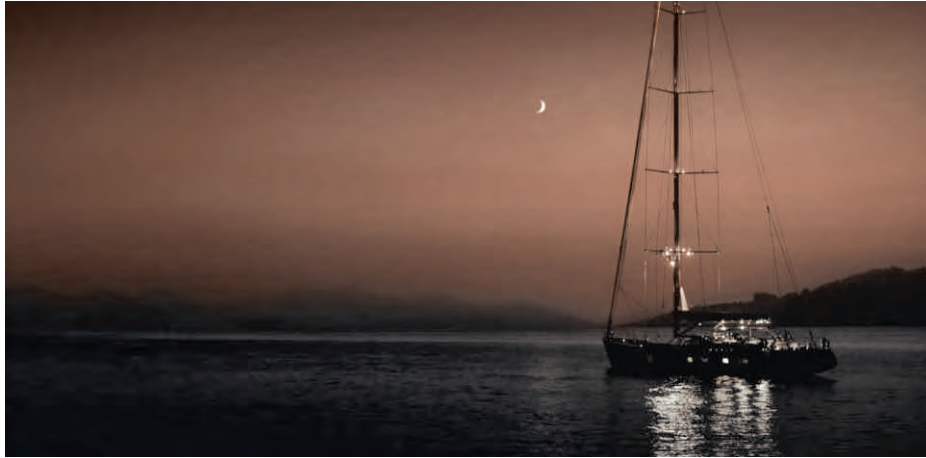
The moon helped mariners to navigate on the open sea and to calculate the tides

————— The moon phase display on the Portuguese Perpetual Calendar, Reference 5023, is a grand-scale theatre on a tiny stage. Attended by a cluster of embossed stars, the moon rises behind the hemispherical cut-out on the left and waxes to full moon in the centre, before disappearing on the right-hand side. IWC's design engineers have calculated that the moon phase display deviates from the duration of the moon's actual course by just 1 day in 577.5 years. No one has so far noticed the difference. In other respects, this elegant,