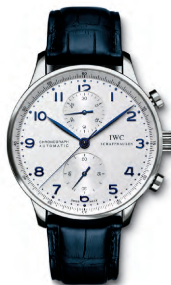
REF. IW371446 in stainless steel with blue alligator leather strap

Mechanical chronograph movement · Self-winding · 44-hour power reserve when fully wound · Stopwatch function with minutes and seconds · Small hacking seconds · Sapphire glass, convex, antireflective coating on both sides · Water-resistant 3 bar · Case height 12.3 mm · Diameter 40.9 mm