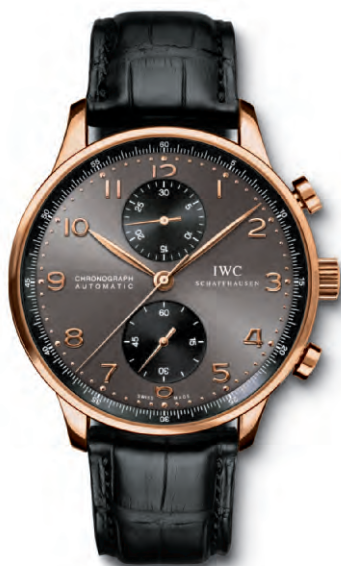
REF. IW371482 in 18-carat red gold with black alligator leather strap