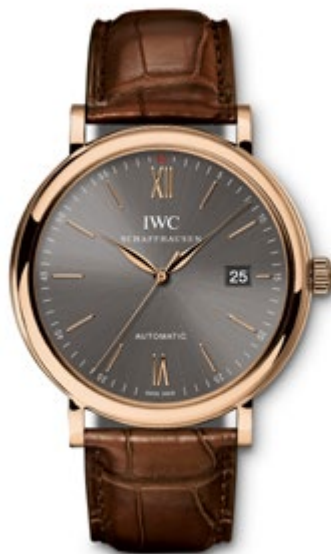
REF. IW356511 in 18-carat red gold with dark brown alligator leather strap