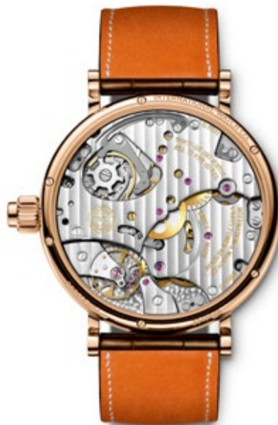
BACK VIEW for both References (shown here is the IW515104)

Mechanical chronograph movement · Hand-wound · IWC-manufactured 59360 calibre (59000-calibre family) · 8-day power reserve when fully wound · Power reserve display · Date display · Stopwatch function with minutes and seconds · Small hacking seconds · Indexless balance with four golden weight screws on the balance rim · Breguet spring · Sapphire glass, arched-edge, antireflective coating on both sides · See-through sapphire-glass back · Water-resistant 3 bar · Case height 13 mm · Diameter 45 mm · Alligator leather strap by Santoni