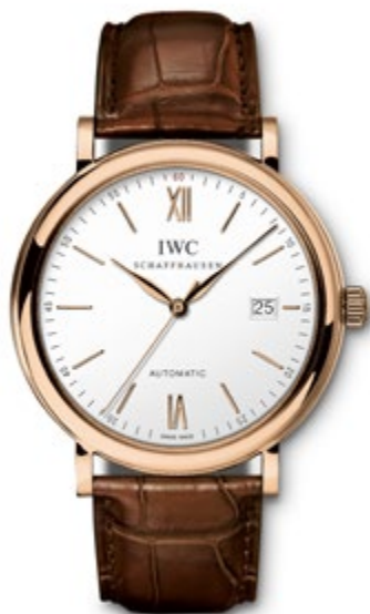
REF. IW356504 in 18-carat red gold with dark brown alligator leather strap