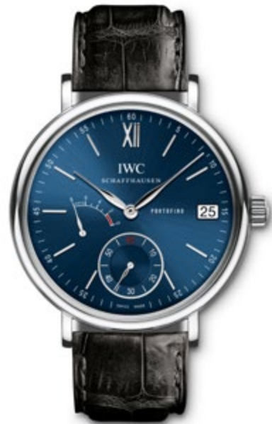
REF. IW510106 in stainless steel with black alligator leather strap

Mechanical movement · Hand-wound · IWC-manufactured 59210 calibre (59000-calibre family) · 8-day power reserve when fully wound · Power reserve display · Date display · Small hacking seconds · Breguet spring · Sapphire glass, arched-edge, antireflective coating on both sides · See-through sapphire-glass back · Water-resistant 3 bar · Case height 12 mm · Diameter 45 mm · Alligator leather strap by Santoni