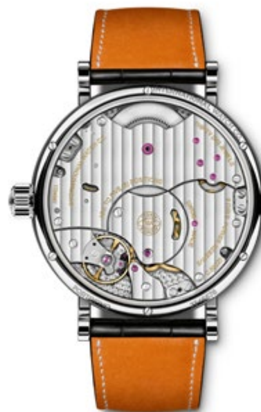
BACK VIEW for both References (shown here is the IW516201)

Mechanical chronograph movement · Hand-wound · IWC-manufactured 59220 calibre (59000-calibre family) · 8-day power reserve when fully wound · Power reserve display · Day and date display · Small hacking seconds · Breguet spring · Sapphire glass, arched-edge, antireflective coating on both sides · See-through sapphire-glass back · Water-resistant 3 bar · Case height 13 mm · Diameter 45 mm · Alligator leather strap by Santoni