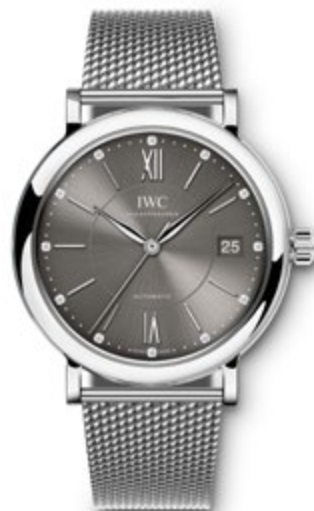
REF. IW458110 in stainless steel with 12 diamonds on the dial and Milanese bracelet in stainless steel

Mechanical movement · Self-winding · 42-hour power reserve when fully wound · Date display · Central hacking seconds · Sapphire glass, convex, antireflective coating on both sides · Water-resistant 3 bar · Case height 9 mm · Diameter 37 mm · Alligator leather strap by Santoni · Milanese bracelet in stainless steel