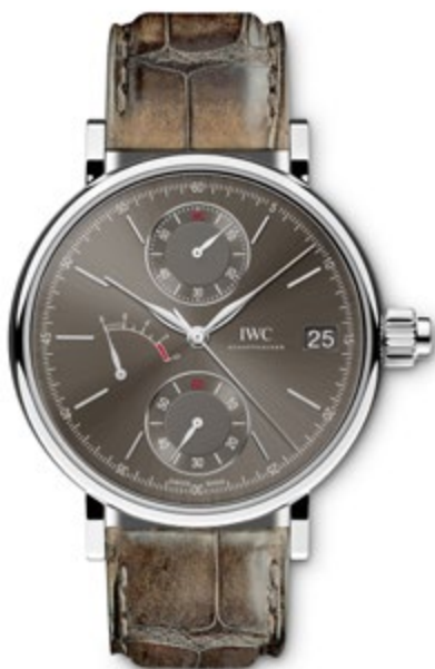
REF. IW515103 in 18-carat white gold with grey alligator leather strap