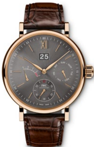
REF. IW516203 in 18-carat red gold with dark brown alligator leather strap