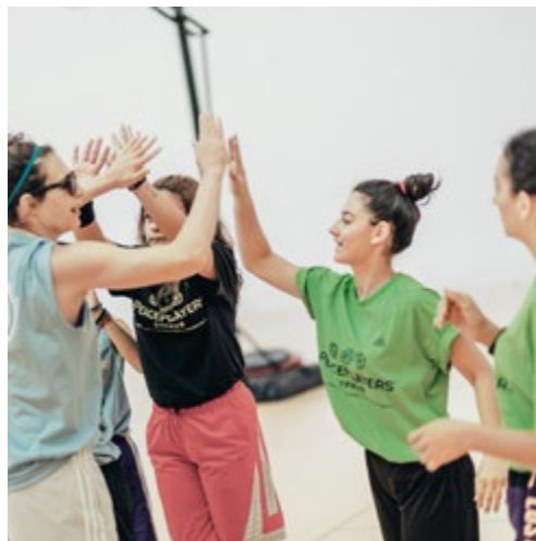
Participants at the Lead for Peace/Laureus Youth Empowerment through Sport (YES) summer camp on Cyprus