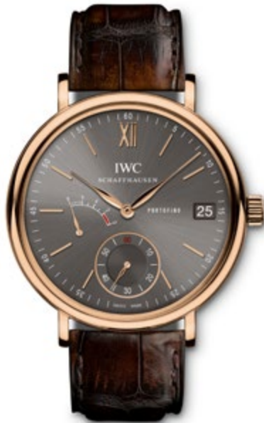
REF. IW510104 in 18-carat red gold with dark brown alligator leather strap