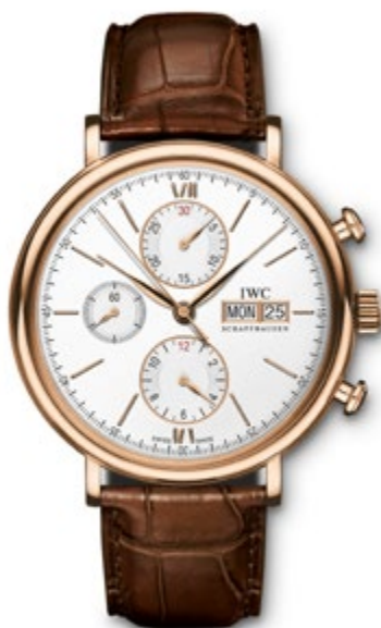
REF. IW391020 in 18-carat red gold with dark brown alligator leather strap