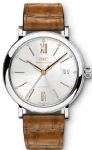
REF. IW458101 in stainless steel with 12 diamonds on the dial and light brown alligator leather strap