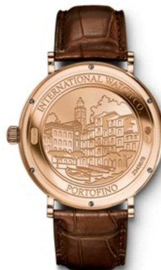
BACK VIEW for both References (illustrated is the IW356511)

Mechanical movement · Self-winding · 42-hour power reserve when fully wound · Date display · Central hacking seconds · Sapphire glass, convex, antireflective coating on both sides · Special back engraving · Water-resistant 3 bar · Case height 9.5 mm · Diameter 40 mm