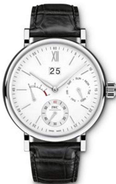
REF. IW516201 in stainless steel with black alligator leather strap