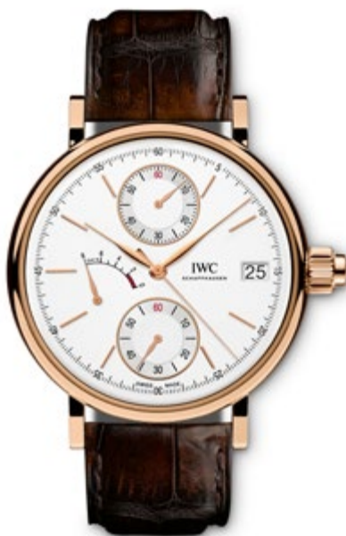
REF. IW515104 in 18-carat red gold with dark brown alligator leather strap