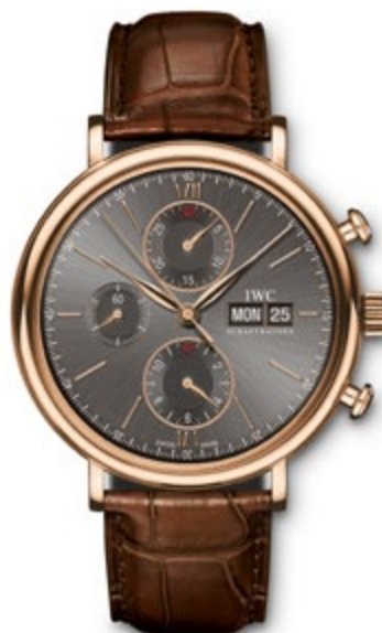
REF. IW391021 in 18-carat red gold with dark brown alligator leather strap

Mechanical chronograph movement · Self-winding · 44-hour power reserve when fully wound · Day and date display · Stopwatch function with hours, minutes and seconds · Small hacking seconds · Sapphire glass, convex, antireflective coating on both sides · Special back engraving · Water-resistant 3 bar · Case height 13.5 mm · Diameter 42 mm