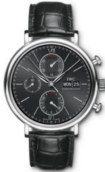
REF. IW391008 in stainless steel with black alligator leather strap

Mechanical chronograph movement · Self-winding · 44-hour power reserve when fully wound · Day and date display · Stopwatch function with hours, minutes and seconds · Small hacking seconds · Sapphire glass, convex, antireflective coating on both sides · Water-resistant 3 bar · Case height 13.5 mm · Diameter 42 mm