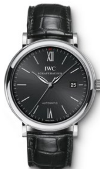
REF. IW 356502 in stainless steel with black alligator leather strap

Mechanical movement · Self-winding · 42-hour power reserve when fully wound · Date display · Central hacking seconds · Sapphire glass, convex, antireflective coating on both sides · Water-resistant 3 bar · Case height 9.5 mm · Diameter 40 mm