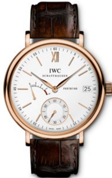
REF. IW510107 in 18-carat red gold with dark brown alligator leather strap

Mechanical movement · Hand-wound · IWC-manufactured 59210 calibre (59000-calibre family) · 8-day power reserve when fully wound · Power reserve display · Date display · Small hacking seconds · Breguet spring · Sapphire glass, arched-edge, antireflective coating on both sides · See-through sapphire-glass back · Water-resistant 3 bar · Case height 12 mm · Diameter 45 mm · Alligator leather strap by Santoni