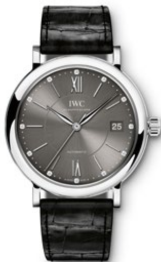
REF. IW458102 in stainless steel with 12 diamonds on the dial and black alligator leather strap