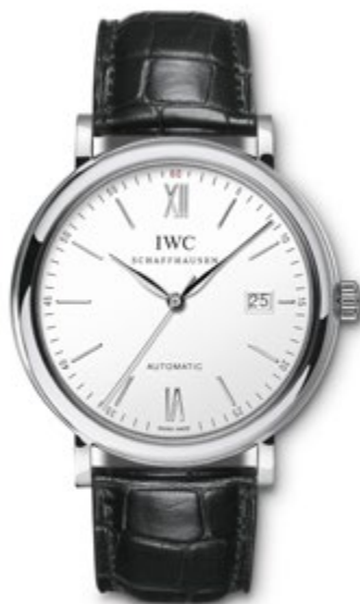
REF. IW 356501 in stainless steel with black alligator leather strap