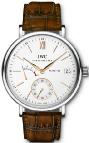
REF. IW510103 in stainless steel with brown alligator leather strap