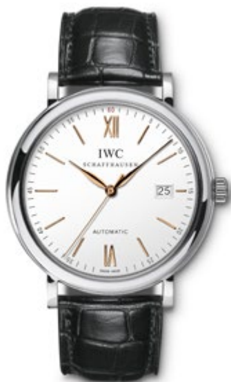
REF. IW 356517 in stainless steel with black alligator leather strap