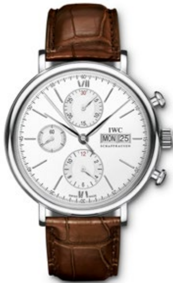
REF. IW391007 in stainless steel with dark brown alligator leather strap