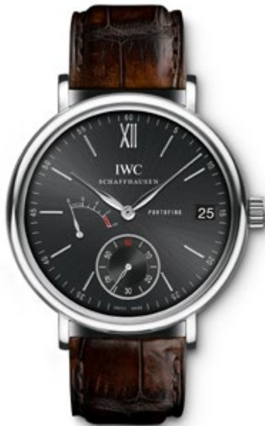
REF. IW510102 in stainless steel with dark brown alligator leather strap